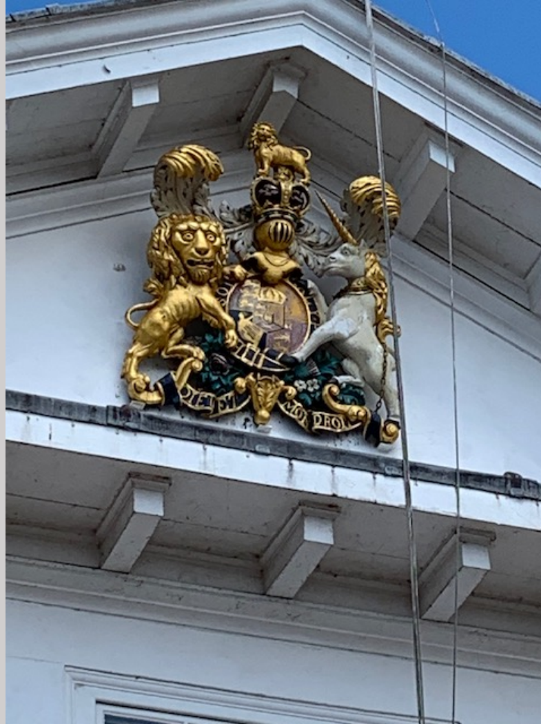
Royal Coat of Arms