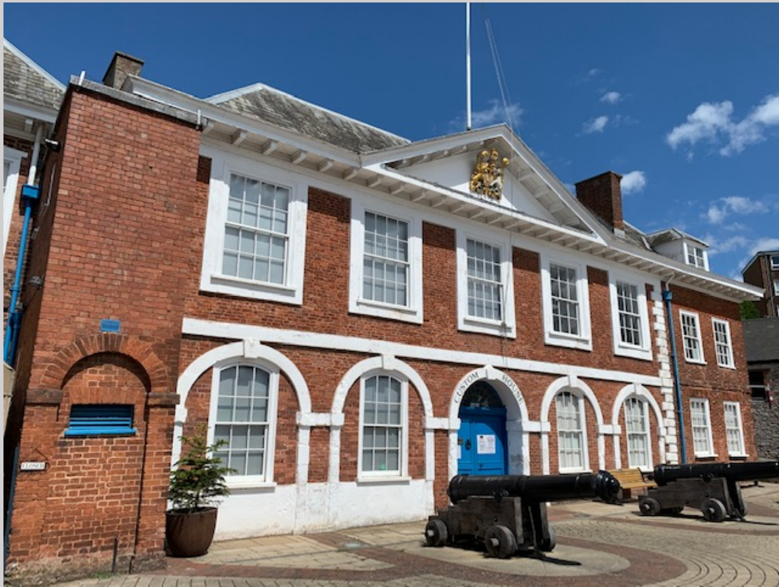
Exeter Custom House, 1680