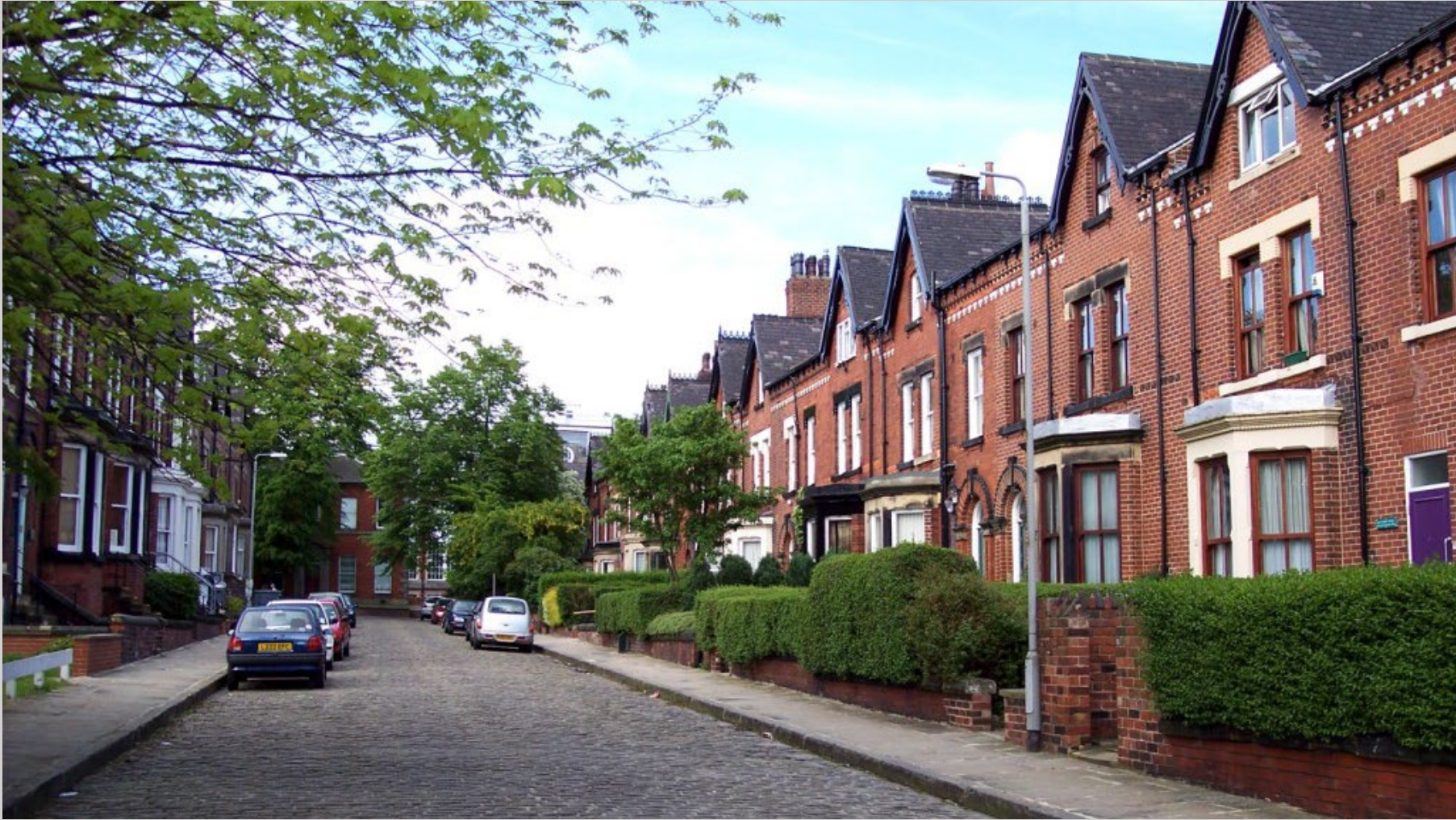
Typical later Victorian terraced houses, built in brick with slate roofs, stone details and modest decoration. Note the bay windows