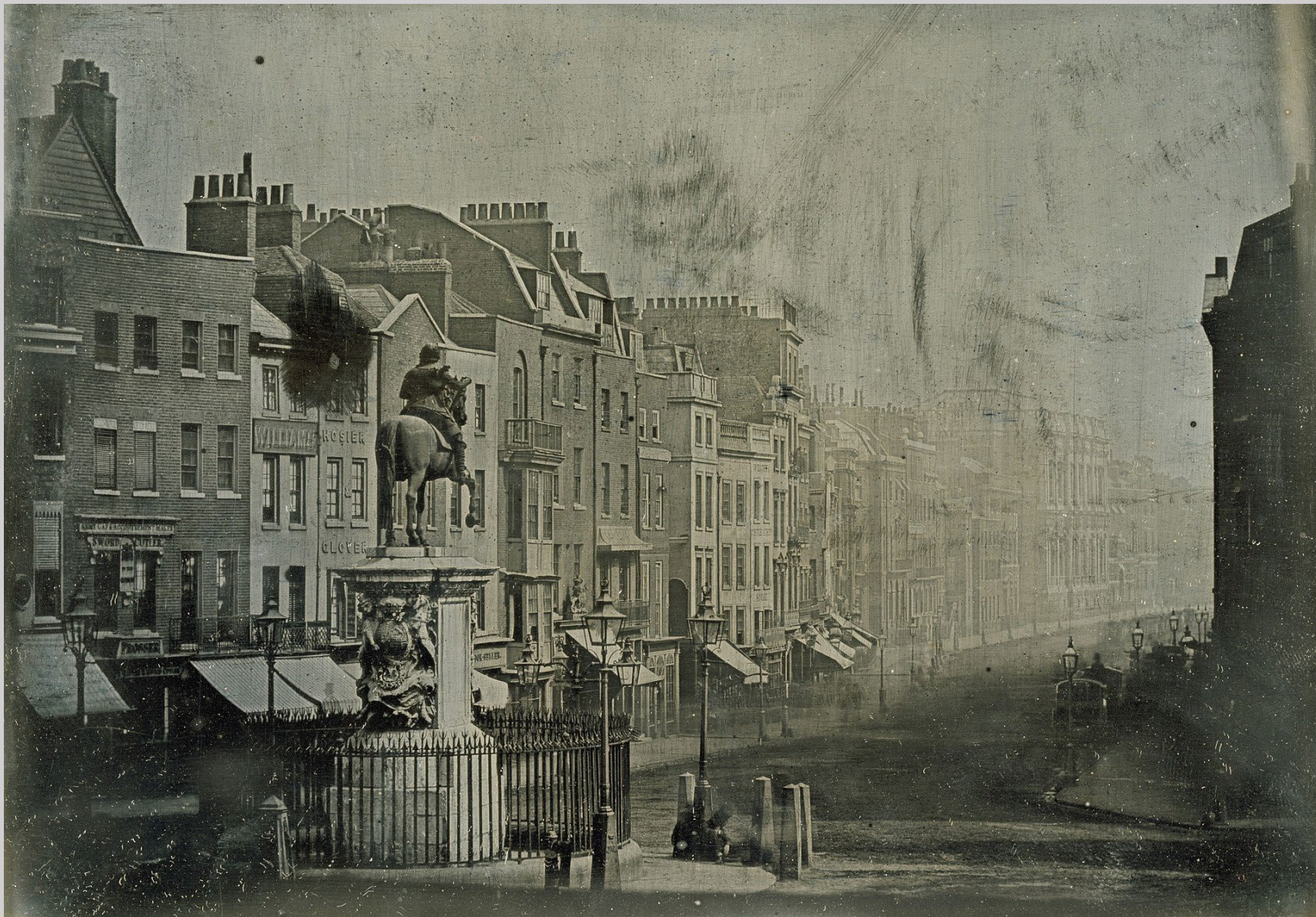
View of Whitehall from Trafalgar Square, 1839.